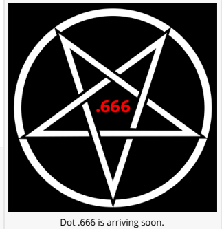
Dot .666 is arriving soon.